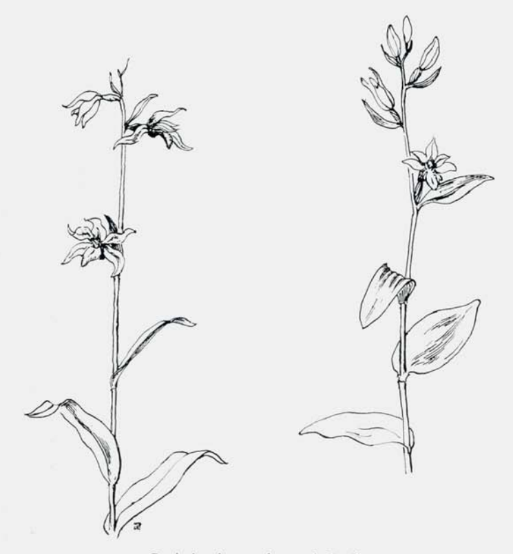
Cephalanthera rubra and C. alba