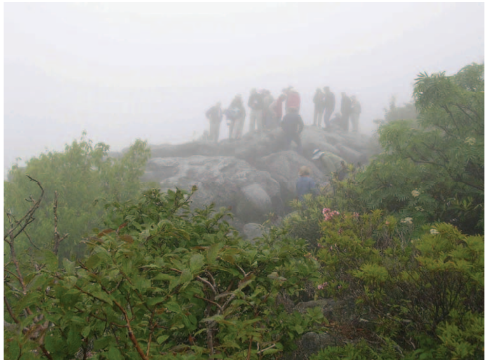
Fog in the Canaan Valley bog

On Friday morning I got up early and we were off to Dolly Sods Wilderness area. You don't just happen to drive into this area. It takes an effort and about an hour's driving time from the lodge. The weather was coolish and the visibility was limited - we could only see the end of the bus! The fog did lift and we got to see many wonderful plants. I saw Cornus canadensis in the wild for the first time. Other old friends were: an old Cypripedium acaule , Rhododendron prinophyllum (=rosea), and Kalmia latifolia . A highlight was seeing the Heuchera alba in full bloom, which only grows in a small area among the boulders. We made a total of four stops, the last being a path that took us thru the woods and over boggy areas. In one of the bogs we saw many of