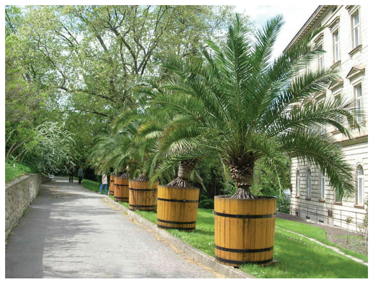
Phoenix canariensis at Charles University Botanical Garden

The current Charles University Botanical Garden was founded in 1898 (some references say 1845) and consists of 3.5 hectares (8.6 acres) There was an older university garden begun in 1775 in Prague, but it was repeatedly damaged by floods over the years and was ultimately relocated to its present site at Na Slupi Street near Charles Square. The botanical garden has the feel of a public park (admission is free) with numerous benches, quiet shady places, and several levels of winding paths, a few of which unexpectedly dead-end. Lilacs, rhododendrons, and azaleas were at their peak of spring bloom when I visited. There are several greenhouses for the protection and display of tender tropical plants, including an extensive collection of cacti, succulents, and aquatic plants, and large old cycads. The bulk of the outdoor collection focuses on trees and flora of central Europe; there is also a small limestone rock garden on a hillside. In addition, there are several mature tree species from North America and large rhododendrons from Asia situated about the garden.