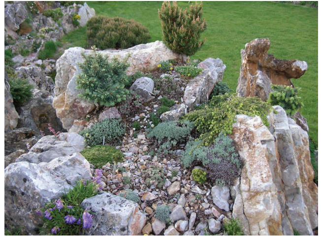
Vojtech Holubec's Crevice Garden

There are mounds of scree, tufa, and flat stones standing upright, all with alpine and rock garden "jewels" tucked