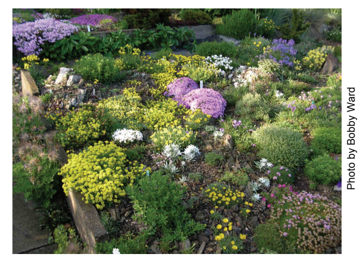
Alenda & Zdenek Linzmajer's Rock Garden

Alena and Zdenek Linzmajer garden on a somewhat dry, clay hillside that faces south with an open, sunny aspect. Their plot was originally rented some 50 years ago by Zdenek's father and a local gardening club. There are other gardens in this collective on adjacent neighboring plots separated by wire fences, where people grow fruits, vegetables, and cut flowers. Originally in an isolated, wooded part of Prague, the collective is now bordered by the busy D-1 highway leading to Brno and by apartments and office buildings. Still, it is a surprisingly peaceful oasis. The site gives the Linzmajers additional space away from their home to grow and test new rock garden plants, one of their passions. They have a well and a shed in which they store fruit from their fruit trees, gardening equipment, and fertilizers.