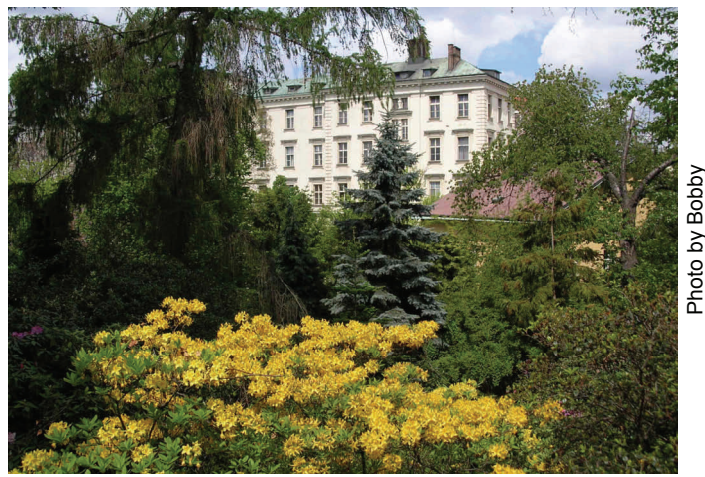
Charles University Botanical Garden

The current Charles University Botanical Garden was founded in 1898 (some references say 1845) and consists of 3.5 hectares (8.6 acres) There was an older university garden begun in 1775 in Prague, but it was repeatedly damaged by floods over the years and was ultimately relocated to its present site at Na Slupi Street near Charles Square. The botanical garden has the feel of a public park (admission is free) with numerous benches, quiet shady places, and several levels of winding paths, a few of which unexpectedly dead-end. Lilacs, rhododendrons, and azaleas were at their peak of spring bloom when I visited. There are several greenhouses for the protection and display of tender tropical plants, including an extensive collection of cacti, succulents, and aquatic plants, and large old cycads. The bulk of the outdoor collection focuses on trees and flora of central Europe; there is also a small limestone rock garden on a hillside. In addition, there are several mature tree species from North America and large rhododendrons from Asia situated about the garden.