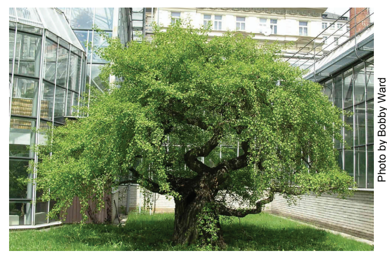
Ginkgo biloba 'Praga': Charles University Botanical Garden

metal sculpture in the waning light. It maintains a sentinel position at the entrance to the Botany Department.