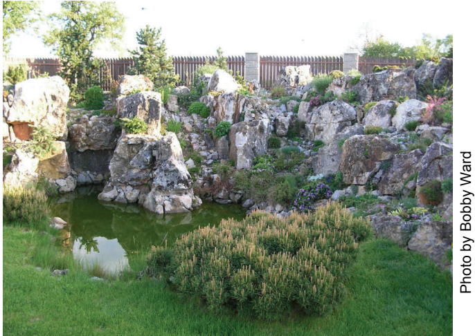
Vojtech Holubec's Garden, Prague

He gardens on 800 square meters (0.2 acre) in the Suchdol section of Prague, across the river from downtown. His walled garden is filled with large boulders that had to