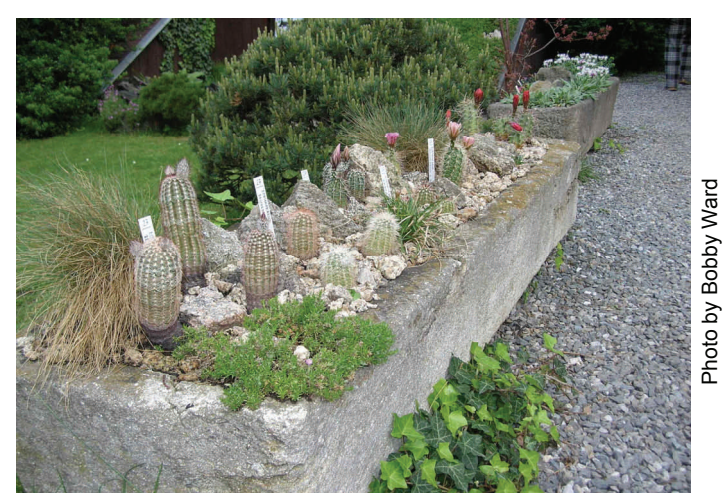
Trough of cactus in the succulent collection, St John on the Rock

drons, daphnes, and small maples spread nearby under a large oak. Scattered among the rocks are Bergenia , Epime dium , Leontopodium , Aquilegia , Clematis , and various genera of orchids. There were also plantings of Genista , Trollius , Tiarella , Dicentra , Alyssum , and Fothergilla . In a sunny area the RGCP has planted large troughs with Echinocactus and other cacti.