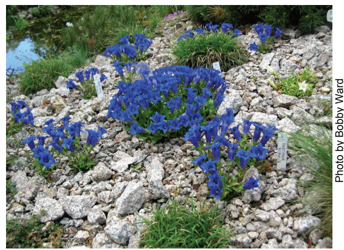
Gentiana acaulis in bloom at St. John on the Rock garden

drons, daphnes, and small maples spread nearby under a large oak. Scattered among the rocks are Bergenia , Epime dium , Leontopodium , Aquilegia , Clematis , and various genera of orchids. There were also plantings of Genista , Trollius , Tiarella , Dicentra , Alyssum , and Fothergilla . In a sunny area the RGCP has planted large troughs with Echinocactus and other cacti.