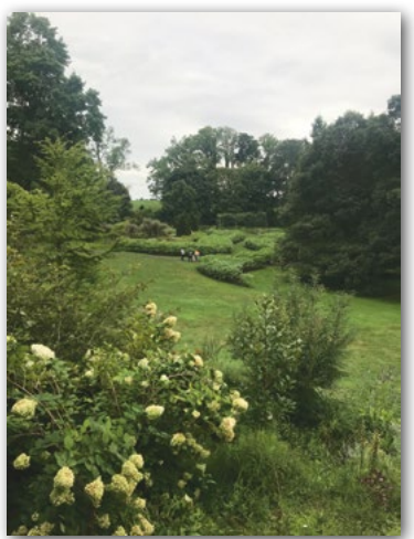
Chanticleer Garden, near Philadelphia, was transformed from a private estate to a public garden, allowing everyone to experience this exuberant and extravagant landscape.