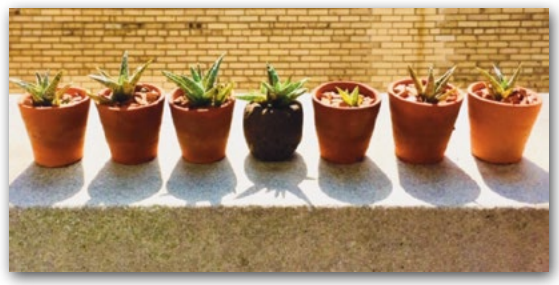
Seventeen years ago I downsized. Parts of my tiny garden now grow on a parapet wall that circumnavigates an equally tiny apartment. Here's to an edgy style of high alpine gardening.

NYBG Midtown Education Center is located at 20 West 44th Street, 3rd floor, between 5th and 6th Avenues (General Society of Mechanics and Tradesmen Building). This location is two blocks from Grand Central Terminal and near several subways.