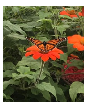
Tithonia rotundifolia 'Torch' with migrating Monarch butterfly