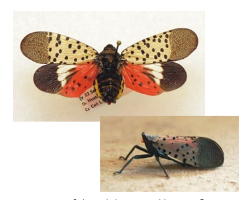
Two views of the adult spotted lanternfly