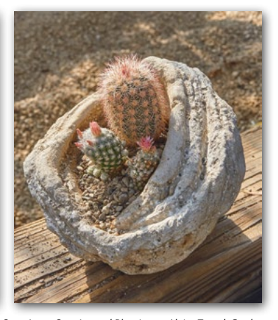
Illustrations\ by\ Lori\ Chips.\ Photos\ by\ Jeff\ McNamara, from\ \textit{Hypertufa}\ Containers:\ Creating\ and\ Planting\ an\ Alpine\ Trough\ Garden