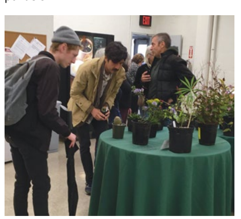
The auction table attracting keen interest