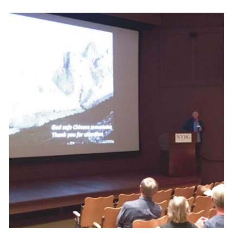
In the lecture hall