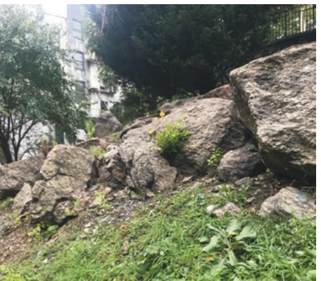
Rock Garden Park