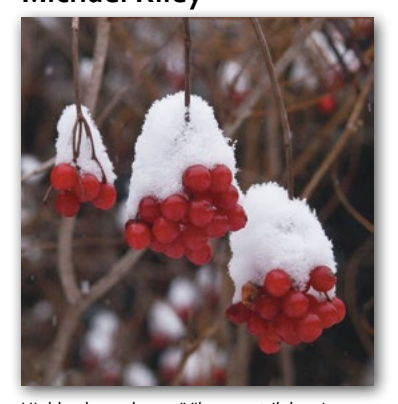
Highbush cranberry ( Viburnum trilobum ) Weather people talk about where snow falls, how much accumulates in a given area, and how it impacts our morning commute ... but how does it affect our plants?