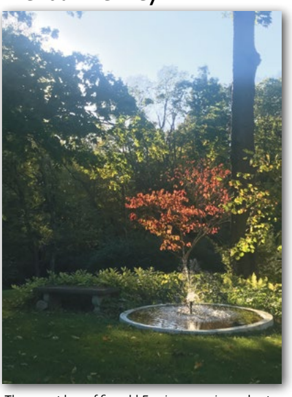
The recent loss of five old Fraxinus americana due to emerald ash borer has added more sunlight to part of the garden

Sixty years of intermittent experience in my mother's garden, which overlooks a glacial river valley in the aptly-named Clay Township.