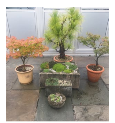
Vojtěch identified several plants that were missing labels and clarified that the draba in the center has no name