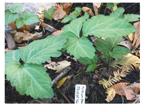
Dentaria maxima at Plant Delights

southern hospitality to an almost unbelievable degree. Truly impressive and greatly appreciated!