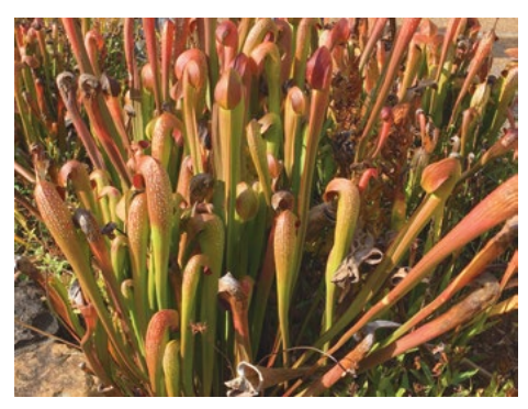
Sarracenia at the NCBG

At lunch I sat next to a landscape architect formerly from the northeast but now living in