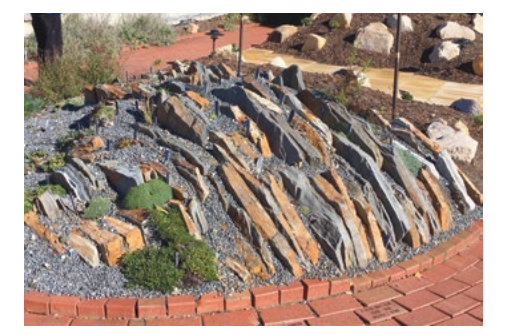
Rooftop crevice garden at the JC Raulston Arboretum