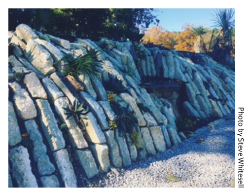
New crevice garden at Plant Delights Nursery

I will insert here that our hosts, the folks from the Piedmont Chapter, were organized down to the smallest detail, and they displayed