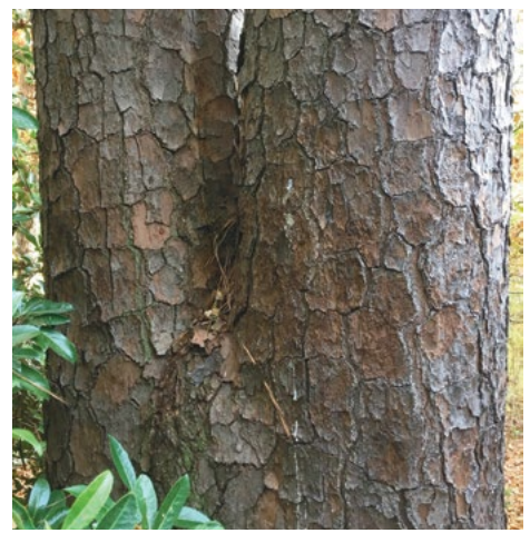
Sarah P. Duke Gardens

the Asheville area and was so fascinated by her that I proceeded to elicit much of her life story (the conversation continued the next day on the bus); again, it was unexpected and wonderful to find how easy it was to fall into conversation with every NARGS person I met; or was it just my good luck to encounter what felt like a lifelong friend everywhere I turned?