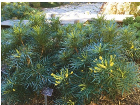
Mahonia at the JC Raulston Arboretum