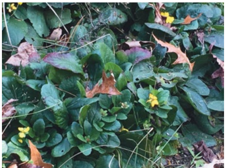
Chrysogonum virginianum at the NCBG