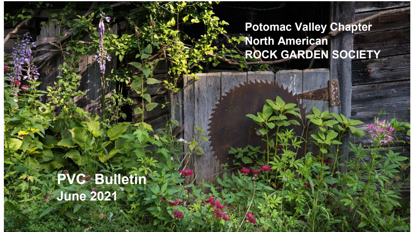
Wollam's Flower Farm, Jeffersonton, Virginia

PVC web page: https://nargs.org/chapter/potomac-valley-chapter