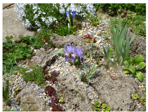
Rad MacFarland's rock garden.

huge stone troughs all around a raised patio, and extensive garden paths with "fairy" features nestled beneath plants and hanging from trees. It is especially nice to tour these gardens with the owners, who talk about the history and their design philosophy and the different plants.