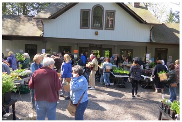
Lots of enthusiastic shoppers!