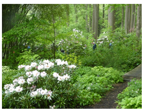
Wayne Guyman's garden, photo by Murray Turoff.

As is traditionally the case, Saturday was all day field trips, scheduled 8 a.m. till 3:30 p.m., but we actually did not get back till almost 5. Two private gardens were spectacular. Wayne Guyman's garden in Chadds Ford Pennsylvania has a huge pond with an island, trails around it, and a hillside planted with thousands of azaleas in bloom at the time, and also thousands of many kinds of Hostas.