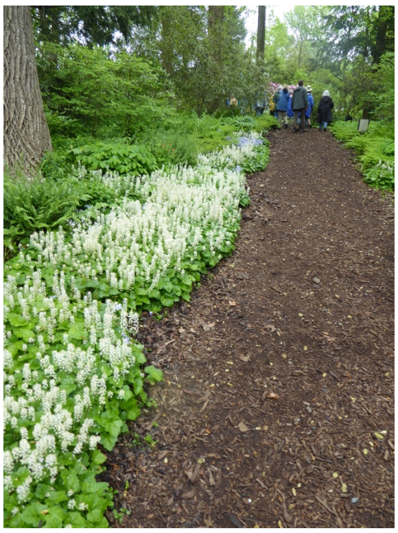
Mount Cuba Woodland Walk; photo by Murray Turoff

open gardens in the area from noon till 4 p.m. and headed home with our buckets of plants from the plant sales.