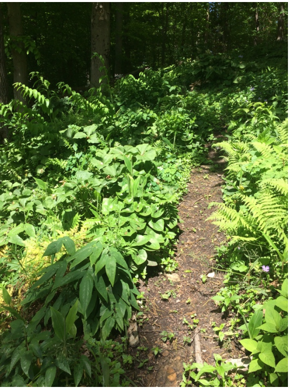
The Woodland Garden at Edgewood Gardens