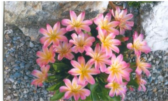
Lewisia in the Kenner garden