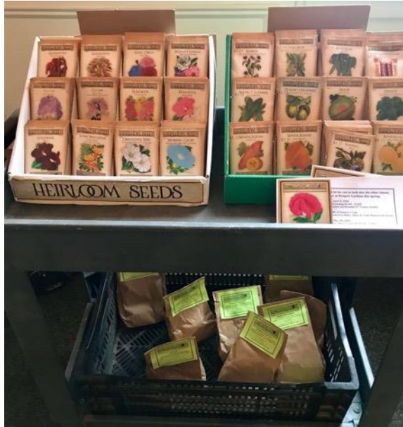
Heirloom seeds for sale at the February meeting.