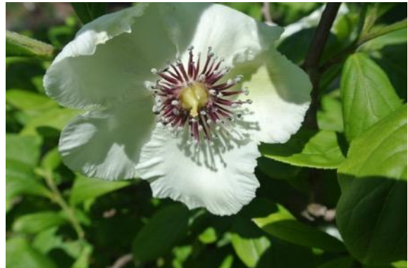
Stewartia malacodendron in the Dembowski garden, photo by Don Dembowski.