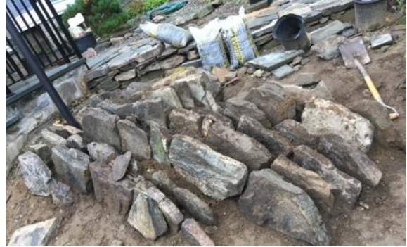
The Dembowski crevice garden, photo by Don Dembowski.

the bus leaves 8:00 a.m. and will return at approximately 4:00 p.m.