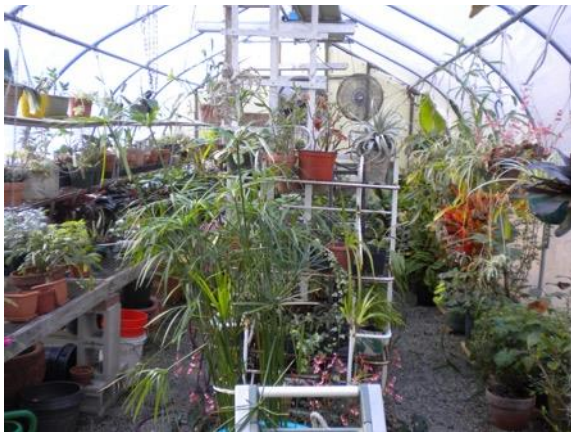
Renate Gudat's greenhouse; photo by Renate.

You may wish to visit a wonderful nursery as well, Rohsler's Allendale Nursery at 100 Franklin Turnpike in Allendale.