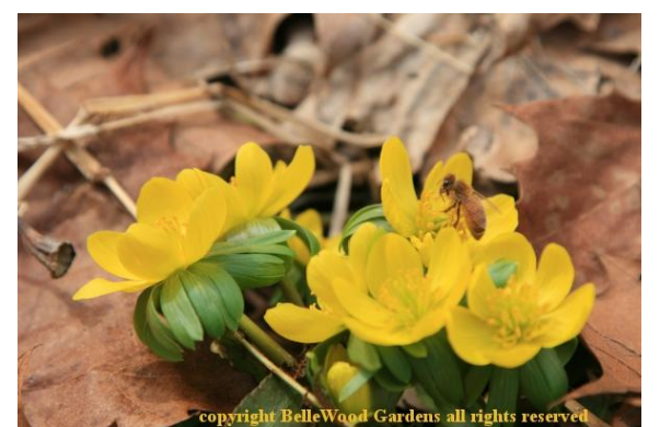
Eranthis hyemalis with a honey bee.

Bring a friend, your favorite early flowering branch or blossom, a warm beverage, and a snack to share.