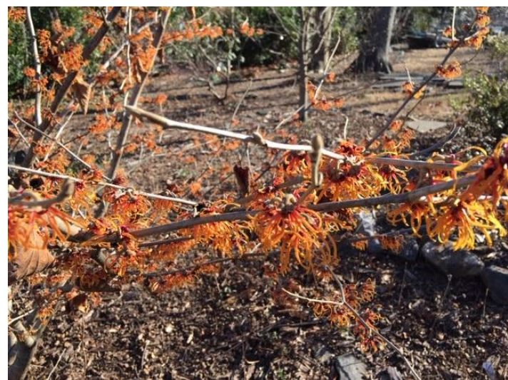
Witch hazel 'Jelena'