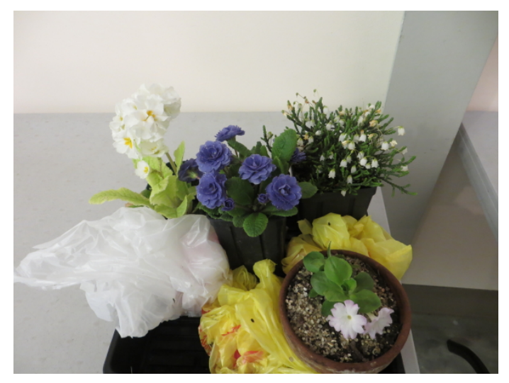
The box with the pretty blue flower (a double petaled primrose) was brought by Jacques for show and tell.