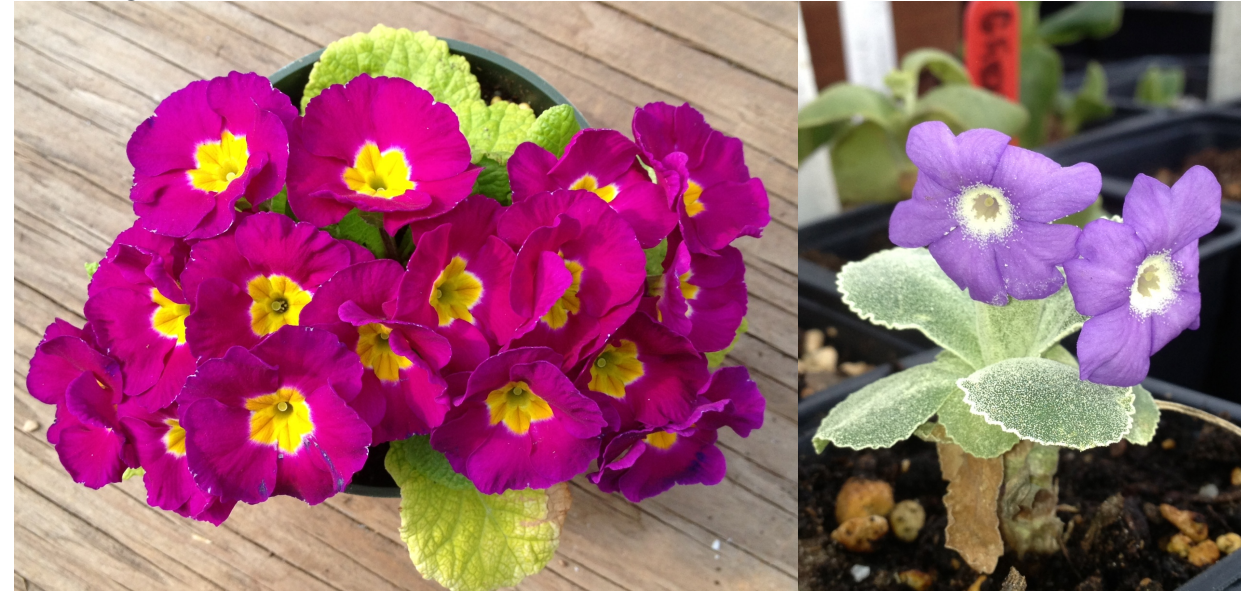
P. polyantha Red Self