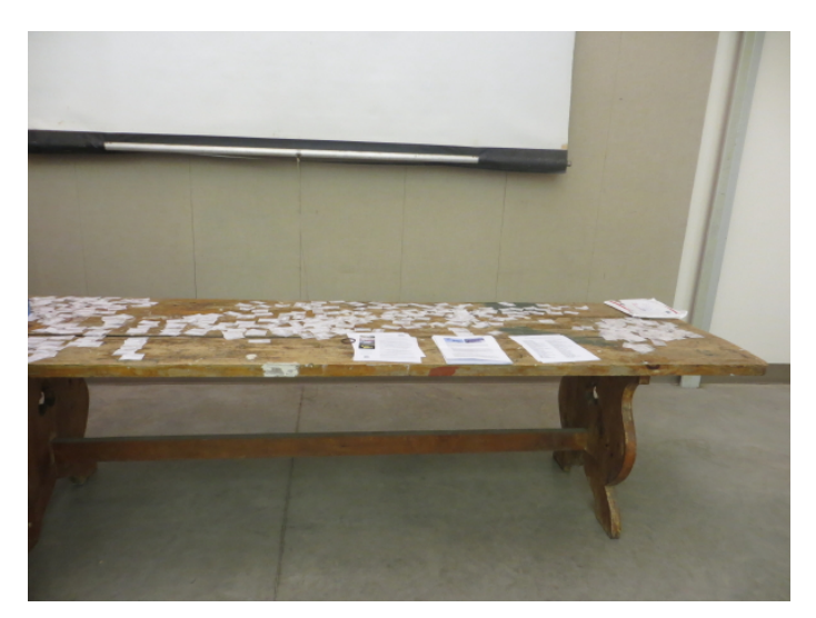
The table with all the seed packs are the extra seeds from the seed exchange which were set up alphabetically and were free to a good home.

The rusty part on an old wheel chair is an old industrial wheel that Dean is going to reuse as a planter. He has placed a board on the bottom to keep the dirt in and is using the old bolt holes for drainage. The old wheel chair is simply and easy way for him to transport heavy objects.