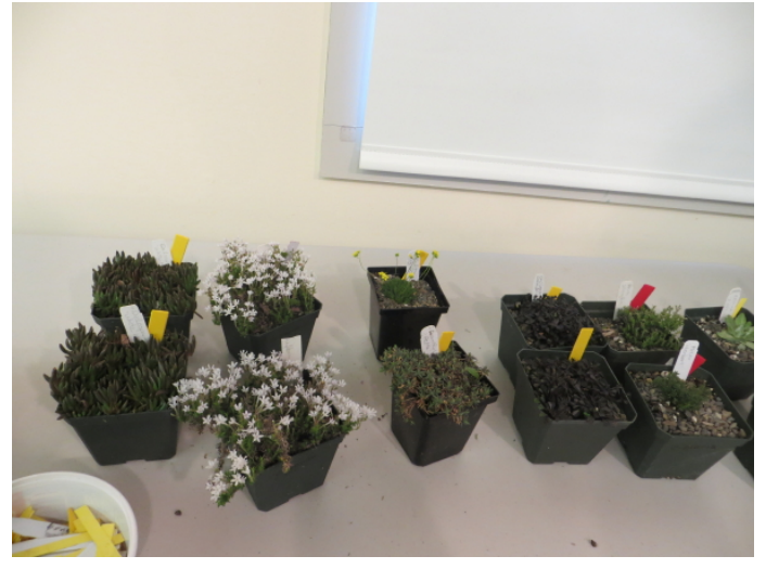
The table of plants with colored tags is from our plant sale, which included dwarf creeping phlox and a cold hardy delosperma.