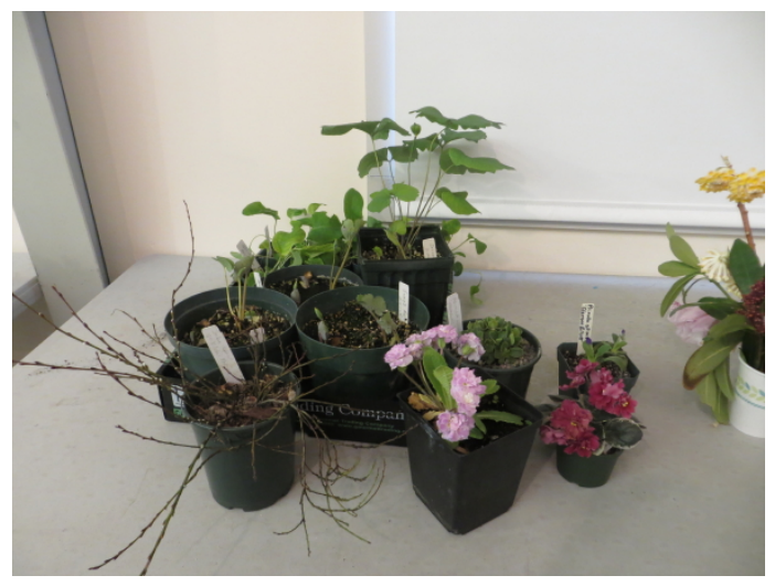
Pink flowering plants were a few choice ones that were raffled off for show and tell.