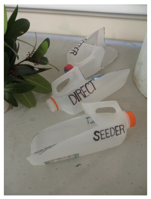
The cut up milk cartoons with Direct Seeder written on them were brought by Dean Evans to show and tell.