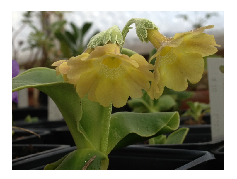
P. marginata "Kesselring"