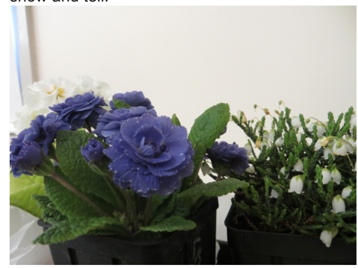
A blue double petaled primrose