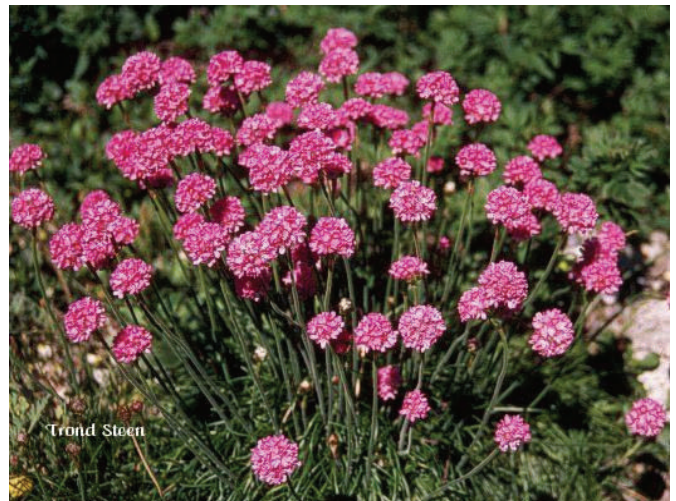
Armeria maritima 'Splendens'

What's on my plant wish list? First, I'm thinking of some easier ones, yet plants that I wouldn't want to be without. And these are versatile enough so that they could be planted in the front of the garden, on walls, in the rock garden or in containers. I'd plant the early flowering