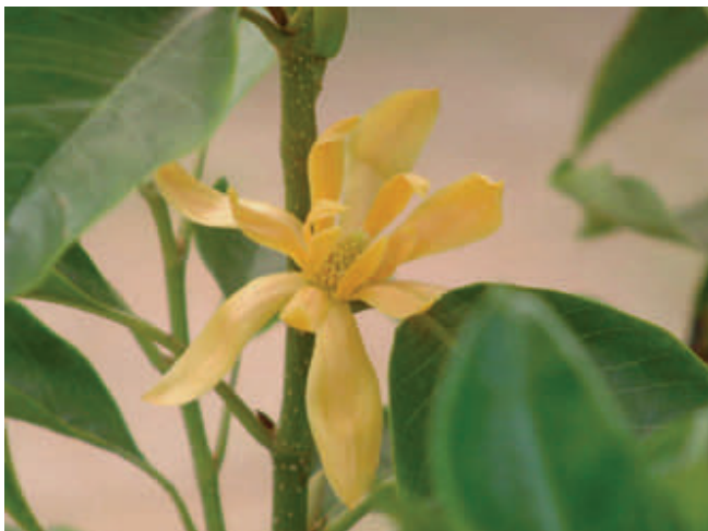
Magnolia champaca flower and seed pod

NC has offered a variety of them but they sell out rapidly. One problem is that they are generally difficult to root from cuttings. They grow readily from seed but most seed sources are in Asia with the usual accompanying