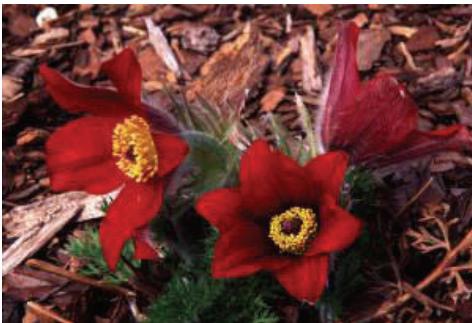
Pulsatilla vulgaris 'Rote Glocke'

One idea I'm entertaining for this spring is turning over a small spot on one end of a perennial border into a 15' x