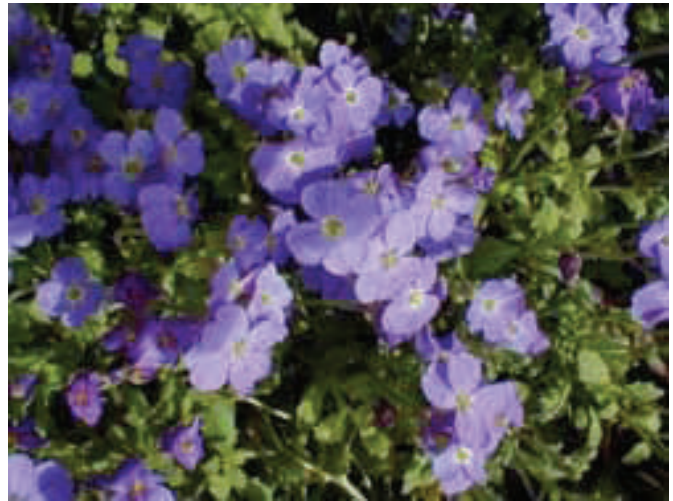
Aubrieta 'Cascade Blue'

15' feature for some of these small plants. I'm going to search for some limestone rocks (indigenous to the Ken-